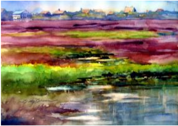
"Ruth Bell's Marsh" Watercolor painting Betty Brown ©2008

SEA VIEW INN 414 Myrtle Avenue Pawleys Island, SC 29585 Phone: 843-237-4253 Email: 1seaview@sc.rr.com Web site: www.seaviewinn.com